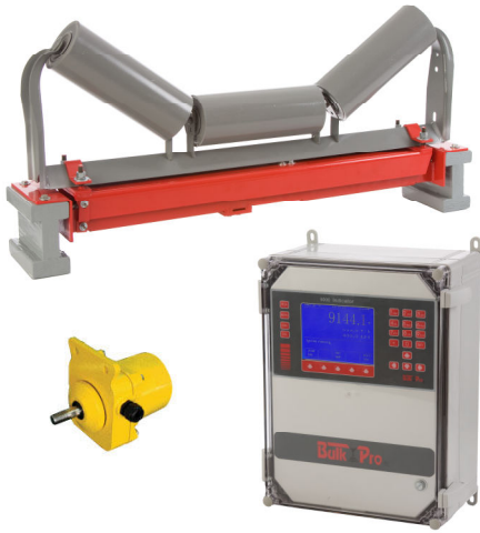
Model N-61 Belt Scale System